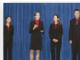
▲ University of Arizona team.