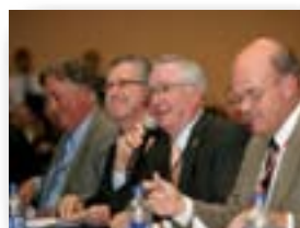
▲ Competition Judges.