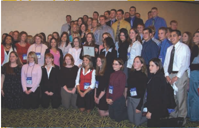
University of Kansas

The University of Kansas was named the 2004 Dargavel Chapter of the Year. Also recognized for their achievements were the