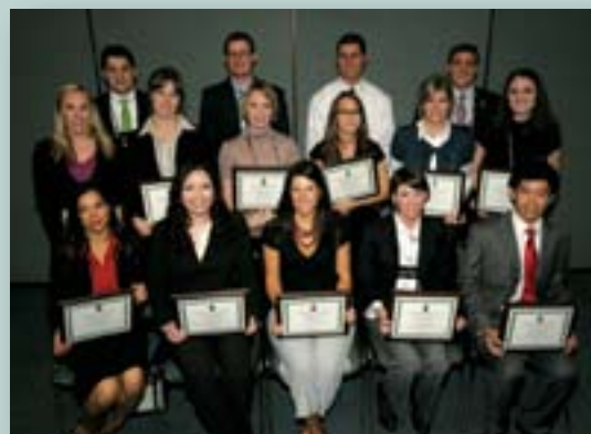
▲ 2007 Presidential Scholarship recipients

The 2007 Presidential Scholarships went to 15 outstanding pharmacy students, each receiving $2,000. The scholarship winners were selected on the basis of academic achievement, leadership qualities, interest in independent community pharmacy, and extracurricular accomplishments.