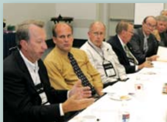
▲ NCPA Foundation Advisory committee meets during NCPA 2007 Annual Convention.