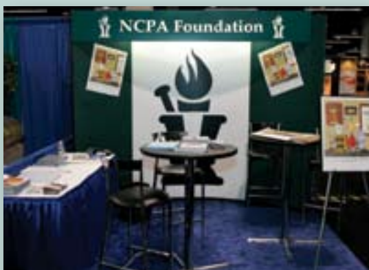
▲ NCPA Foundation booth at NCPA 2007 Annual Convention and Trade Exposition.