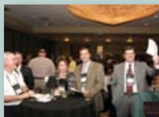
◀ A satisfied auction bidder!