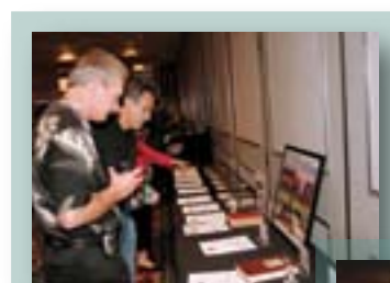
◀ Bidders peruse the extensive display of auction items.

The NCPA Foundation's 18th Annual Auction and Reception, its largest annual fall fundraiser, provided a fun evening of bidding in live and silent auctions on unique antique pharmacy items, sports memorabilia, sporting events and equipment, vacation homes, hotel packages, books, electronics, and so much more. Complimentary appetizers, drinks, music, and professional auctioneers contributed to the evening merriment. The auction was held during the 2007 Annual Convention.