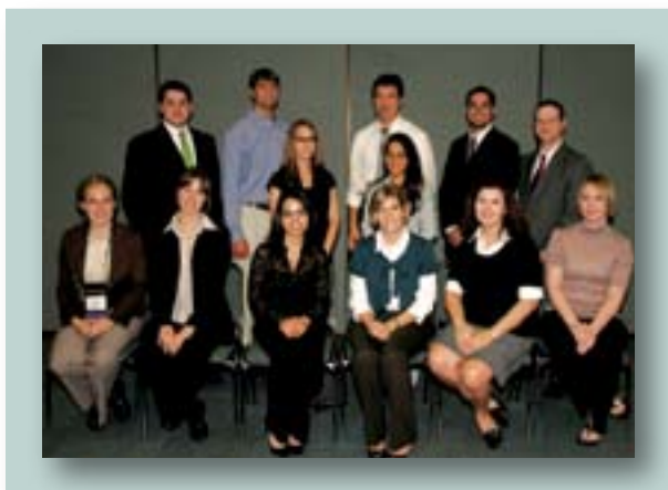
▲ NCPA Student Executive Council 2007

The structure is based on two-year terms. The first year is served on the Student Regional Council, which supports the NCPA Student Affairs Department in making pharmacy