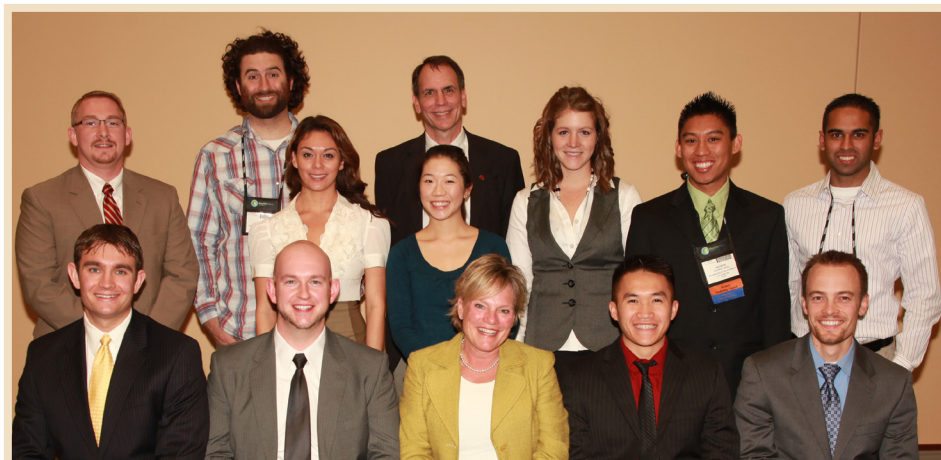
Winner: 2010 Washington State University Business Plan Team and NCPA Student Chapter