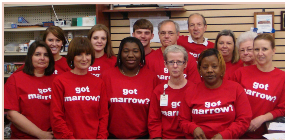
Bone marrow volunteers at Sadler-Hughes Apothecary in Clinton, South Carolina

A key focus of the NCPA Foundation is to increase pharmacy students' aware-