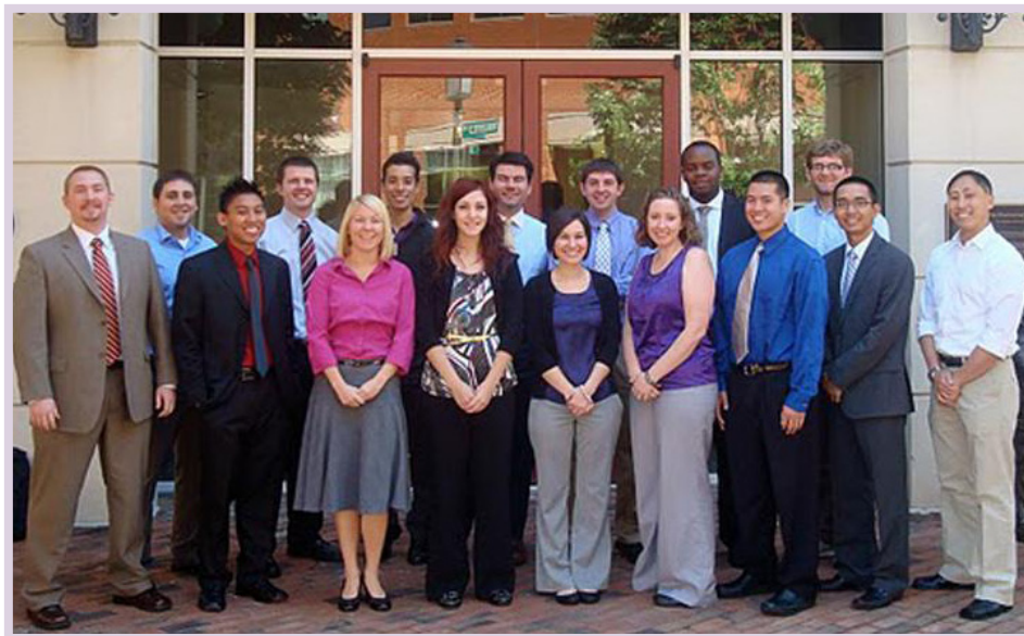
Student Leadership Council