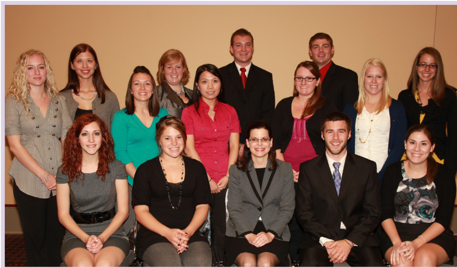
2010 Chapter of the Year: Ohio Northern University