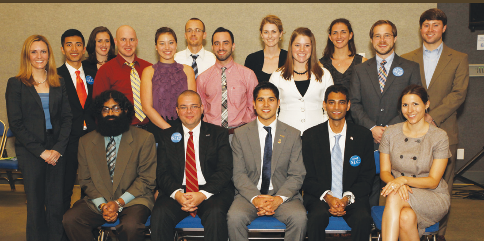
2012-13 NCPA Student Leadership Council